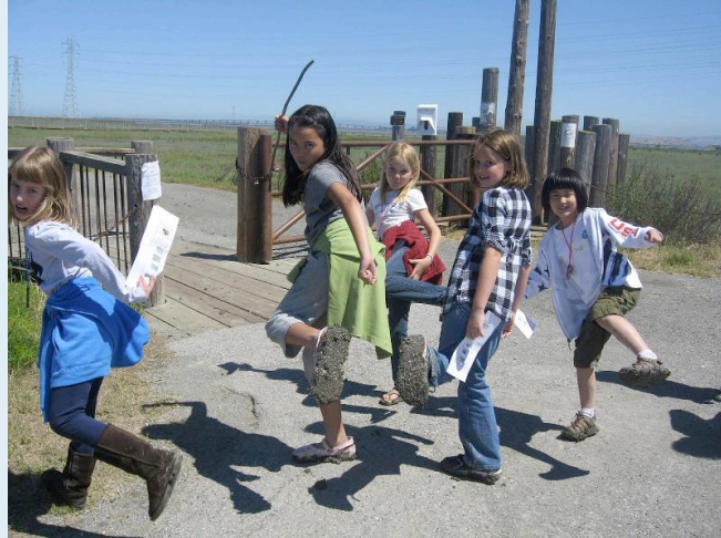
S.N.A.K.E. Campers showing off the Bay mud on their shoes after a hike in the Baylands.

To read more about each of the exciting themed weeks, click here .