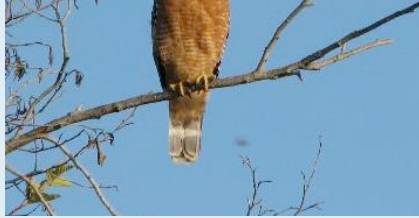
red shouldered hawk in a tree.