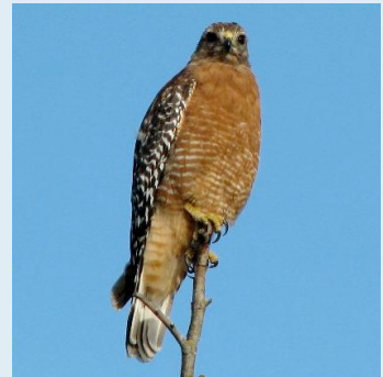
A red shouldered hawk spies them.

If you have any images, from EV services, field trips or your own excursions, and would like to share them with the EV community, please send them to justyne@evols.org .