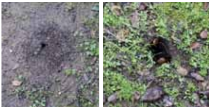
2 holes - left is likely an insect and right is likely a rodent

You could encounter any number of bird species on this trip, and students will often know only a few of them. Have students make observations about the birds. How big are they? Are they singing? How are they interacting with each other — are they trying to get another bird to leave? These are the kinds of things birders study to help them identify a bird. If the birds are at a distance or in the shade, color or beak shape is harder to spot — but if you can see these features, it is good to note as well. See if the students can determine a general category of bird (raptor, songbird, duck, etc.). If they think the bird is sort of like a _____, but not quite, have them identify what the differences are (e.g., a coot is not a duck but it’s pretty duck-like). Ask if the students can think of birds they know from a category. They may have studied some in the EV classroom program. At the very end, identify the bird for the students (if you know it).