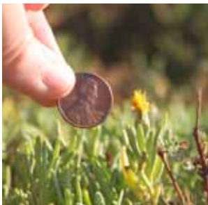
Smaller than a penny

Have each person take a yarn ring (made from about 18” of yarn) and lay it on the ground near the trail. Caution them to find a spot without poison oak (and help them to do so if they need assistance). Explore this “mini-ecology” for different leaf shapes, seeds, decomposers, animals, etc. using all of the senses. How are all of these things connected? i.e., producers, consumers, decomposers, including water and energy. How are you connected to your circle?