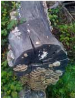
Turkey Tails on a log