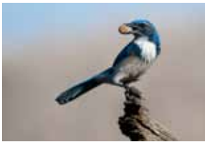
Western Scrub Jay