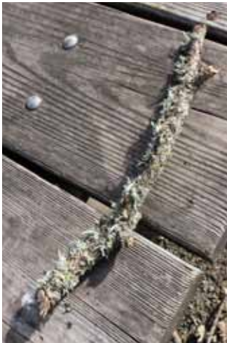
Life on a stick

Give each student a paper cup “nest.” Pick one of your students to be the jay and the rest to be juncos. The jay must close their eyes while the juncos go off to build nests (hide their paper cups). The juncos then come back to the EV standing near the jay, get some food (1 small dried bean) and take it back to the nest. After some time, the jay is allowed to open his/her eyes and search for food. The juncos continue to go back and forth collecting food. When the jay finds a nest with food in it, they dump the beans into their own “nest” cup. After some more time, have the juncos go collect their nests and come back to the group. Explain that all birds need food to raise their young. Juncos need 3 beans for each young. Jays need 5 beans. Discuss strategies for hiding and protecting nests, and strategies for finding nests.