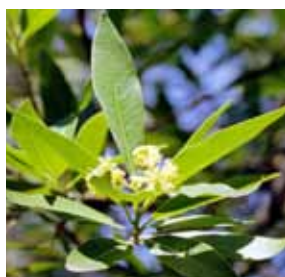
California bay laurel

The buckeye is adapted to the dry season by leafing out as early as January and then dropping its leaves in June. The leaves are compound (meaning they have multiple smaller leaflets in each leaf) and have five leaflets arranged like fingers on your hand. The seed is large and looks like a buck's eye. It falls and rolls away from the tree. At certain times of the year you can find one that has sent out the initial root. The Ohlone used the seeds as a backup to acorn mush. Buckeyes need a lot of leaching and don't taste as good as acorns.