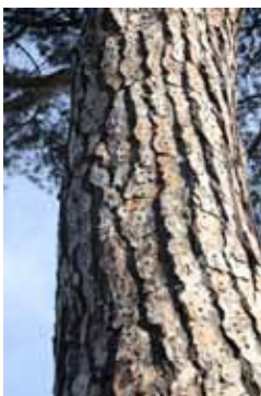
Granary tree—close up

Mounds of dirt found throughout a field are gopher holes. Remind students not to stomp on the dirt mounds, as these are the gophers’ homes. We know these are made by gophers because the holes are covered up. Moles don’t bother covering their holes and California ground squirrels tend to excavate around their holes so they are almost funnel-shaped.