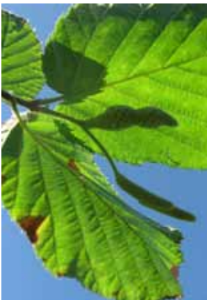
Leaf in the sun