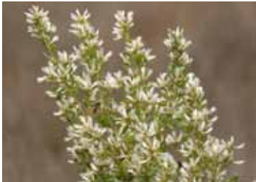
Coyote bush - female flowers

During the fall, you can find the nuts. Break one open and show students how similar they are to another familiar California tree – the avocado.